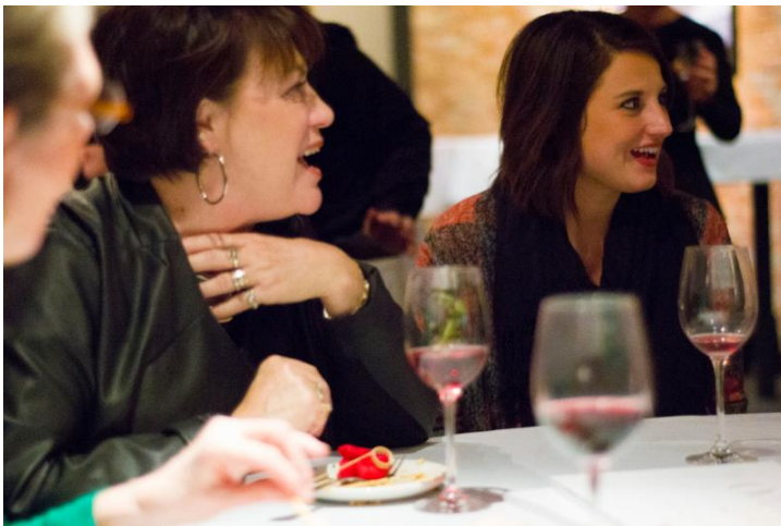
Executive Director of the IWF.

Dine and Unwind took place Thursday, December 10 in Cedar Falls. Dine and Unwind provides an evening of fine food, conversation, and fundraising for the Iowa Women's Foundation. Attendees enjoyed hors d'oeuvres, fine wine and friends at Montage in downtown Cedar Falls. The evening concluded with remarks by the evening's co-hosts and the